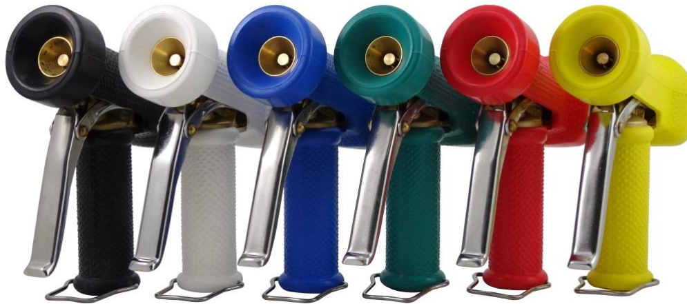
KLMN001-BL black KLMN001-B blue KLMN001-R red KLMN001-W white KLMN001-G green KLMN001-Y yellow

All bold printed items are ex. Stock available