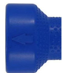
Arrow for beam direction

*** Hoewel alle materialen temperaturen van boven de 100° C aan kunnen, wordt aanbevolen speciale voorzorgsmaatregelen te nemen als heet water wordt gebruikt.